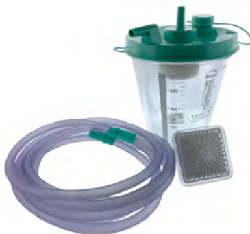
BR980-9256: CleanTract™, ENT Disposable Suction Pump Kit, consisting of Air Filter Pump, Suction Tubing 10ft, and Fluid canister 1200CC, 5/box

To insure a high standard in hygiene the components should be physically inspected and changed daily or weekly based on the amount of usage of the system.