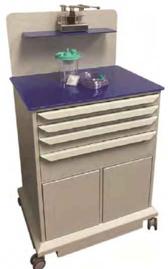
*Work with most manufacturers cabinets *Shown on BR Surgical treatment cabinet

Over 20,000 Surgical Instruments & Procedure Sets • Endoscopic Video Equipment & Related Medical Devices